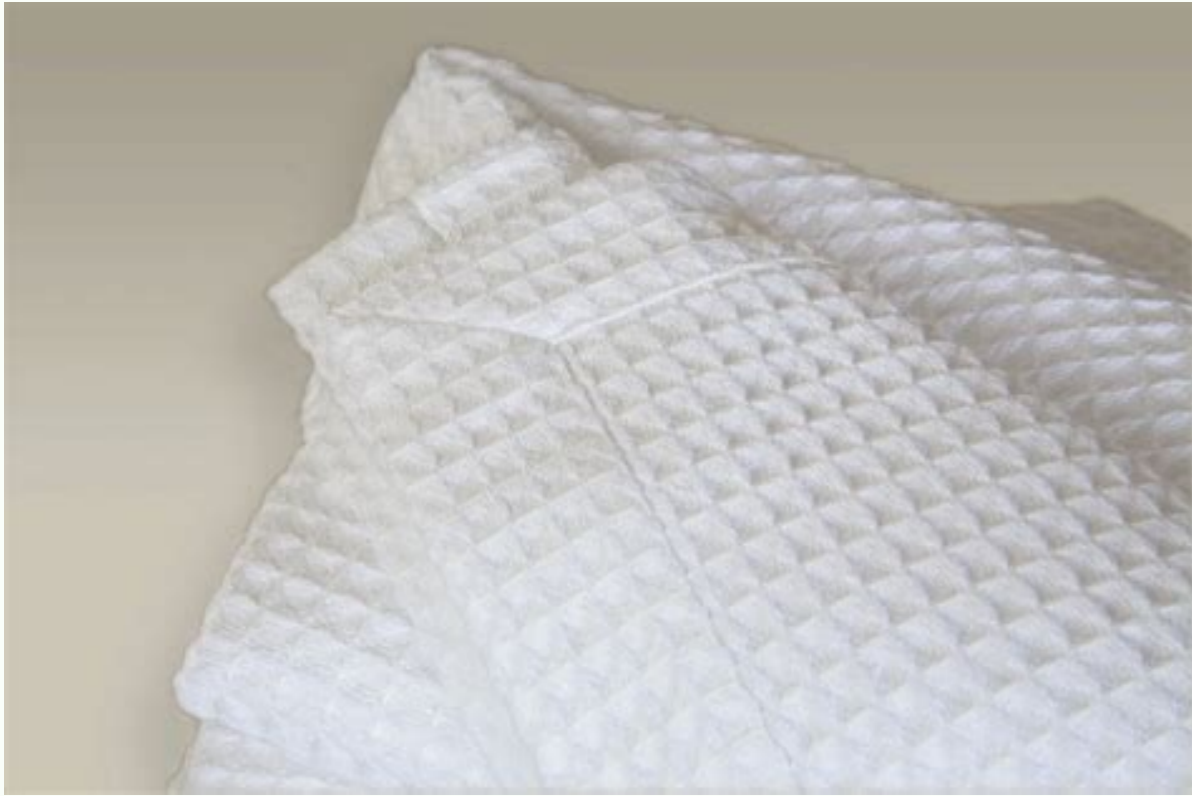
Highest count egyptian cotton sheets. Egyptian cotton sheets vs cotton. What are the best egyptian cotton sheets.